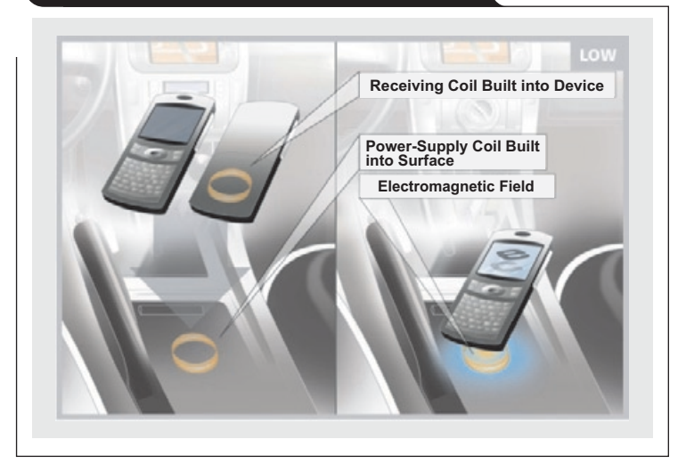
Figure 3. Concept of inductively coupled power supply

There are a variety of solutions being developed to address these concerns. A great example is eCoupled<sup>TM</sup> technology developed by Fulton Innovation. This technology includes an inductively coupled power-supply circuit that dynamically seeks resonance, adapting its operation to match the needs of each device it supplies (see Figure 3). By communicating with each device individually in real time, eCoupled technology not only determines power needs but also takes into account the age of a battery or device and its charging life cycles. This supplies the optimal