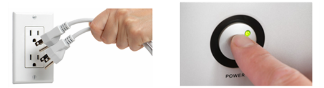
Figure 2. Uncontrolled Power off vs. Controlled Power off

input capacitor's discharge time. In controlled power off, power off is controlled by the processor, achieved by connecting the processor's power-management I/O to the power sequencing controller's enable pin. Figure 2 shows power off situation examples in daily life.