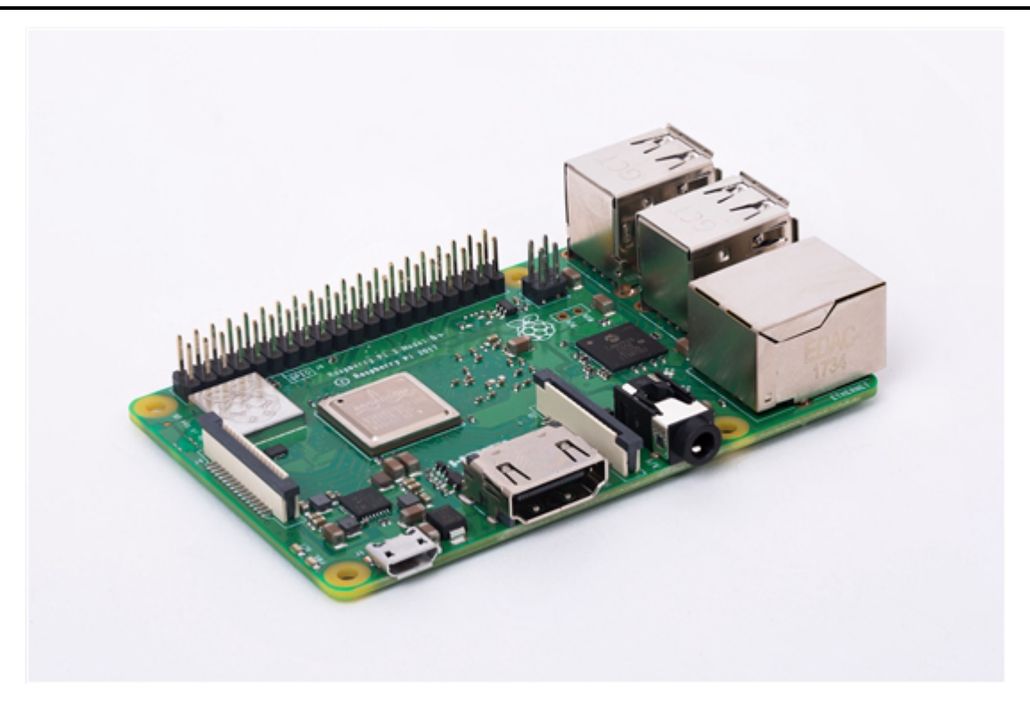
Figure 2. Raspberry Pi Board

For example, you can change the DLP LightCrafter Display 2000 EVM's video output configuration to RGB666. This, along with the introduction of a new software-defined I<sup>2</sup>C bus on the Raspberry Pi, makes it possible for the host processor to host the EVM despite its smaller GPIO pin count. Furthermore, the "VINTF" line on the EVM allows any host processor to use its customized I<sup>2</sup>C level (such as 3.3V or 5V) to control the system. We've already seen developers in the TI E2E™ Community and online start to develop solutions for the Raspberry Pi. Like the Raspberry Pi, other host processors can be interfaced with the LightCrafter Display 2000 EVM to suit a variety of project needs.