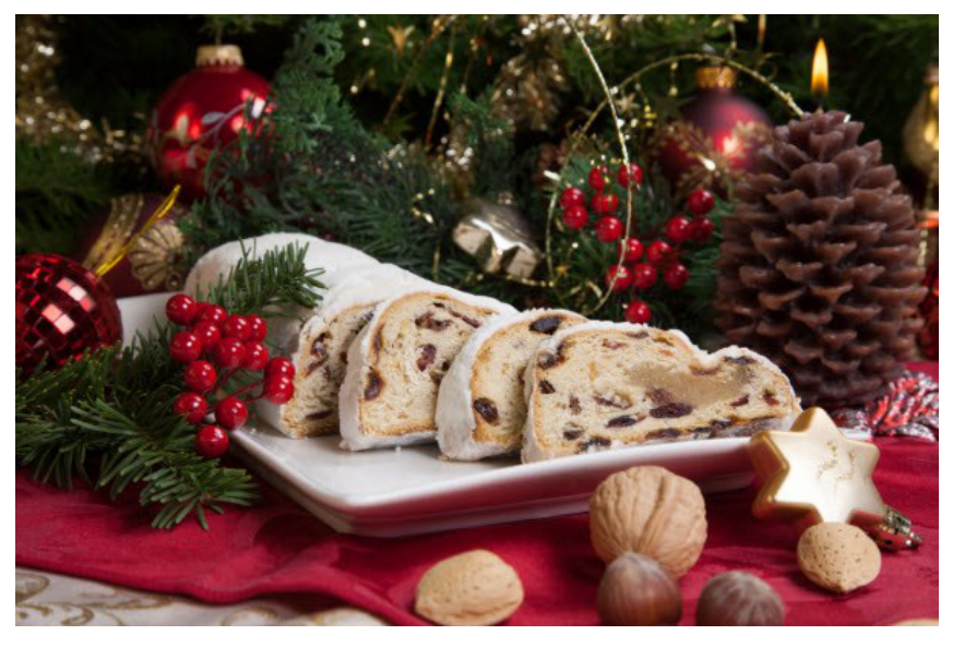
Figure 3. Anyone Ready for Some Stollen and Christmas Cookies?

So if you want to ease getting cooking and baking recipes conveniently right the first time, consider integrating accurate weighing capabilities into your kitchen appliance with our reference design.