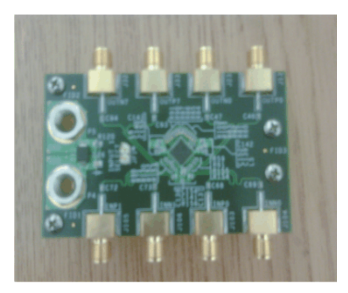
Figure 1. CDCLVP1208EVM Evaluation Board