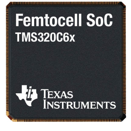
Figure 3. New femtocell devices based on TI's multicore SoC architecture integrate fixed and floating point capabilities in the industry's highest performing CPU.

The key feature bringing everything together is TI's Multicore Navigator, which abstracts the notion of multicore and allows each core to act independently under the control of the Multicore Navigator hardware. Because of the abstraction of cores, coprocessors and peripherals, software developed targeting Multicore Navigator requires minimal modification, as the hardware is scaled to the performance needs of the different types of base stations in a heterogeneous network. This common architecture (Figure 3) – across multiple base station products – also affords a new ease of maintenance and installation for wireless operators.