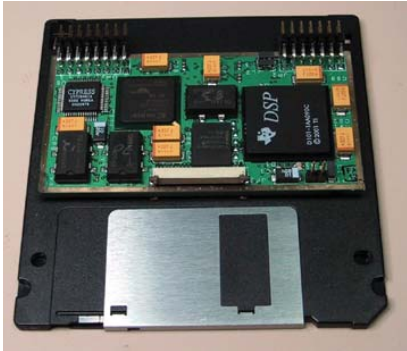
Figure 2. IBOC Digital Module

Showing the small form factor, Figure 2 depicts the IBOC Digital Module (IDM) and the single-chip baseband. This small form factor will be necessary for home and automotive applications.