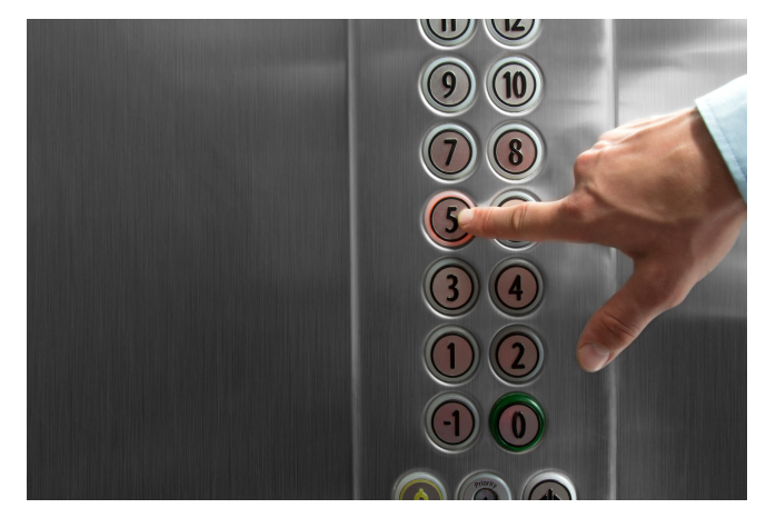
Figure 1. Example of a modern elevator push button.

To better understand how intended functions and safety functions work together, assume that the elevator in a building with 20 floors has a push-button circuit (see Figure 1 ) with a fault the elevator motor controller interprets as sending the elevator to the 25th or 30th floor (that is, floors that don't exist in the building). A bounds check would catch the fault before it results in an error, or eventually, a failure. This is the accepted progression in functional safety: "faults" lead to "errors," while some errors can lead to "failures."