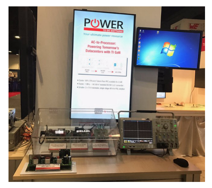
Figure 2. End-to-end GaN Solution - from AC to Point-of-load

Figure 1. 3kW Interleaved Totem Pole PFC, GaN-based Reference Design Featured at APEC 2017